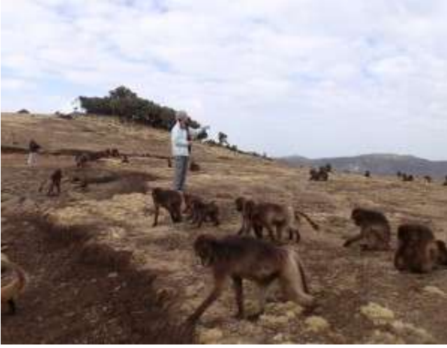
Groups of Gelada Baboon up-close