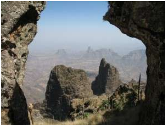
Magnificent view at Emet Gogo