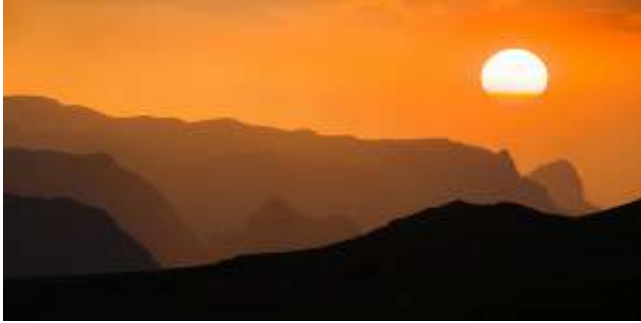
Gich camp sunset on the top of Kedadit

depends on your interest). After we arrive at the campsite, you have some time for snack and then head out for a short optional sunset trek up about 185m above the camp to Kedadit. On this point (3,786m), you will look 360 degree around the Simien Mountains and to the lowland mountains. Then, we will come back to the camp for dinner.