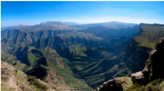
On the top of Mt. Emet Gogo looking down to the lowland...

In Gich campsite, the sunrise is earlier than the other campsites. After breakfast, we will climb to Mt. Imet Gogo, an incredible rocky promontory and the most spectacular view point in the Simien Mountains. This is really breathtaking view and you will never forget in your mind. 300m gentle slope take you to the summit that grants 360 degree views over the Simien Mountain range. It descends about 300m to the valley, which is the source of the Jinba river. The trekking route passes vegetated area through Festuca grassland, Lobelia plant, everlasting flower, Erica Arboria tree. Then, we will head through the jangle to the Aynmeda camp, where your car is waiting for you. We will drive to Gondar.