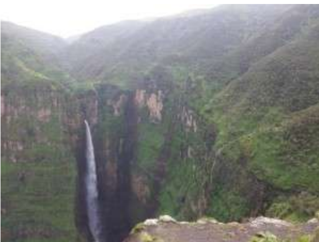
Jinba waterfall, the longest fall in Ethiopia

After a breakfast, you will set off trekking to Gich. It is about 15km, 7 hours trek. You will trek along the edge with stunning views over the foothills 800m below. The trail passes most vegetated area in the park through low bush of Giant Heather, Abyssinian Rose, Oliveria and Globe Thistle. You will most certainly encounter troops of the endemic gelada baboons and see them up-close. You may also see Klipspringer, bushbuck, rockhyrax in the steep rocky and wooded slopes. Leopards live around here and you may have chance to spot leopard. The highlight of the trek is Jinba waterfalls, an incredible 500m sheer drop, the longest fall in Ethiopia. From the viewpoint opposite, you will see the different vultures such as Griffen Vulture, Hooded Vulture, Whitebacked Vulture, Lapped- faced vulture and Lammergayer along the cliff. Lammergayer is one of the biggest bird prey in the world and feeds bone marrow. This area is best place for lammergayer to break the bone. This area is also good to see different small birds such as one of the Ethiopian endemic bird- Abyssinian Catbird, Starlings, Sweafts and Swallows.