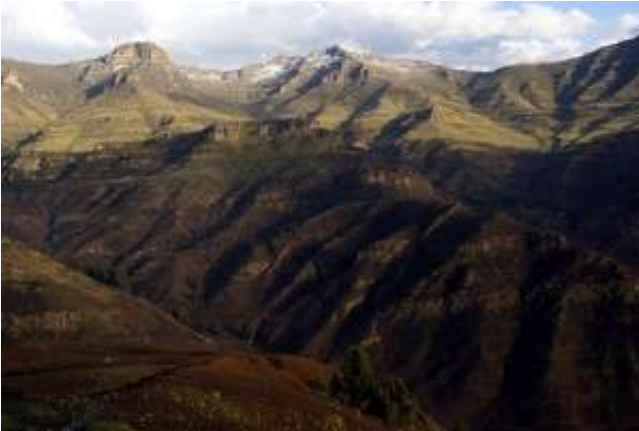
Ambiko to Ras Dejen