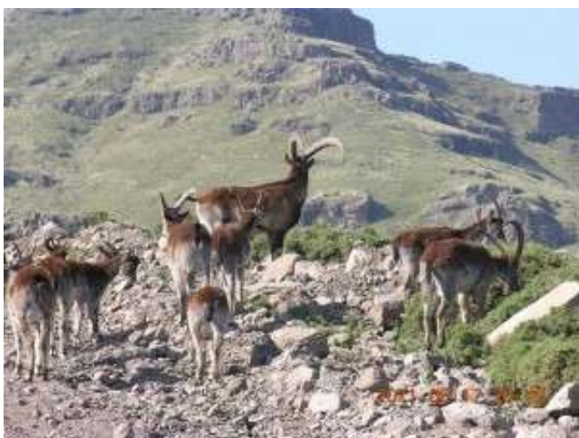
One of the endemic wildgoat found only in this national park, nowhere-else in the world (Capra Ibex Walia)