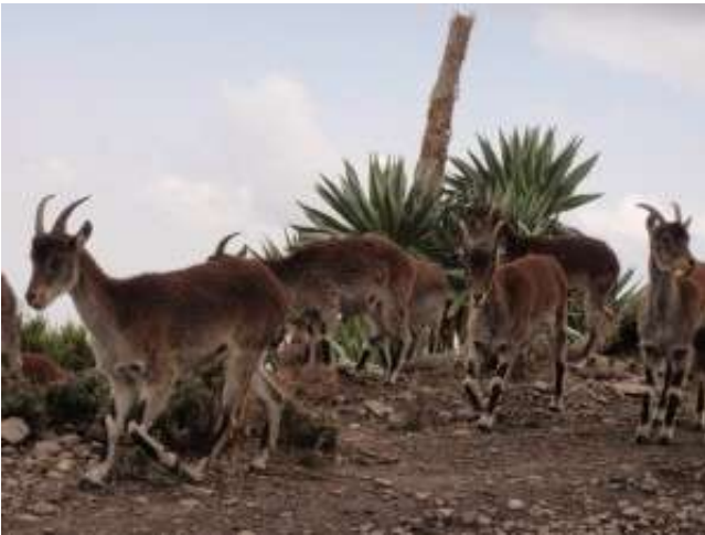
One of the endemic wildgoat found only in this national park, nowhere-else in the world (Capra Ibex Walia)

On the fourth day, we will prepare for the longest trip so far (25km), trekking about 9-10 hours. From Chenneck camp, we will ascend 600m to Mt. Bwahit Pass and continue to Ambiko camp, which is the base camp to Ras Dejen. We will trek along the edge which descends 1,450m to Chiroleba village. Then, we follow the valley and descend down to Meshea river (2,750m). When you reach near to the river, you will see different plant species that are different from highlands, namely Ephorbia, Oliveria (Aloymacropetra). From Meshea river, we will trek to Ambiko camp. This campsite is located along the banks of a stream and in a small village. It is a project of the local church and a donation for the facilities is gratefully accepted.