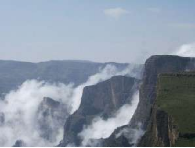
Trek from Mt. Innatye to Chenneck