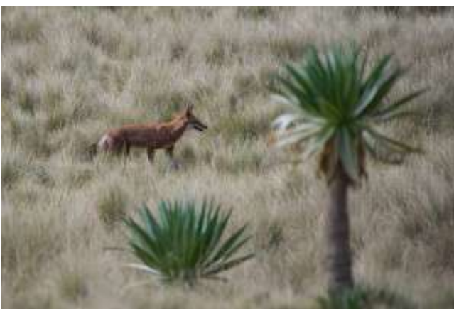
Ethiopian wolf around the source of jinba river

In Gich campsite, the sunrise is earlier than the other campsites. After breakfast, we will climb to Mt. Imet Gogo, an incredible rocky promontory and the most spectacular view point in the Simien Mountains. This is really breathtaking view and you will never forget in your mind. 300m gentle slope take you to the summit that grants 360 degree views over the Simien Mountain range. It descends about 300m to the valley, which is the source of the Jinba river. The trekking route passes vegetated area through Festuca grassland, Lobelia plant, everlasting flower, Erica Arboria tree. Then, we will climb Mt. Innatye about 500m up to the summit passing through the jangle. You will enjoy the stunning views and terrifying vertical drop views. The views are arguably the best in the Simien Mountains. After having a picnic lunch on the top of the Mt. Innatye, the path follows mostly downhill though open grassland and Giant Lobelia towards Chenneck camp. Chenneck camp is the third camping site of the national park and is located in a beautiful valley at the foot of the Mt. Bwahit, at the altitude about 3,620m. You will encounter a number of stunning viewpoints along the way. Moreover, this area is superb for wildlife with both Gelada Boboons and Walia Ibex.