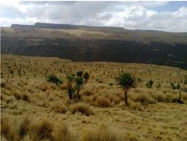
Looking opposite side to Mt. Innatye

In Gich campsite, the sunrise is earlier than the other campsites. After breakfast, we will climb to Mt. Emet Gogo, an incredible rocky promontory and the most spectacular view point in the Simien Mountains. This is really breathtaking view and you will never forget in your mind. 300m gentle slope take you to the summit that grants 360 degree views over the Simien Mountain range. It descends about 300m to the valley, which is the source of the Jinba river. The trekking route passes vegetated area through Festuca grassland, Lobelia plant, everlasting flower, Erica Arboria tree. Then, we will climb Mt. Innatye about 500m up to the summit passing through the jangle. You will enjoy the stunning views and terrifying vertical drop views. The views are arguably the best in the Simien Mountains. After having a picnic lunch on the top of the Mt. Innatye, the path follows mostly downhill through open grassland and Giant Lobelia towards Chenneck camp. Chenneck camp is the third camping site of the national park and is located in a beautiful valley at the foot of the Mt. Bwahit, at the altitude about 3,620m. You will encounter a number of stunning viewpoints along the way. Moreover, this area is superb for wildlife with both Gelada Boboons and Walia Ibex.