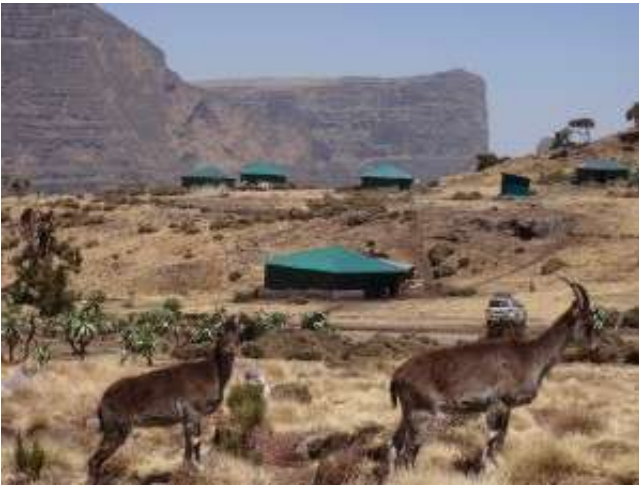
Chenneck camp, one of the best camping area to spot Walia Ibex and scenery

After a breakfast, we will walk from Chenneck to Mt. Bwahit(4,300) which is the second highest point in the Simien Mountains. It is about 5 hours trekking. We are ascending 800m to the summit through stunning escarpment on the Afro Alpine Moorland route. We will spot Walia Ibex (Capra Ibex Walia), probably Ethiopian Wolf and different plant species evergreen and the high elevation plant Lobelia which grow above 3,600masl, everlasting flower, Erica Arboria tree, St. Johns Worttree(Hypericumrevoltum), and Festuca grass. After climbing the Mt. Bwahit, we will come back to Chenneck camp where we spend the fourth night.