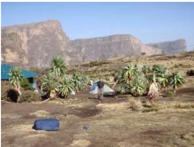
Chenneck campsite boasts one of the best scenery in the

After a breakfast, we will trek from Gich camp to Chenneck camp. Along the way, we will climb Mt. Innatye about 500m up to the summit pass through the jungle and enjoy the stunning views and terrifying vertical drop views. The views are arguably the best in the Simien Mountains. After having a picnic lunch on the top of the Mt. Innatye, the path follows mostly downhill through open grassland and Giant Lobelia towards Chenneck camp. This camp is the third camping site of the national park and is located in a beautiful valley at the foot of the Mt. Bwahit, at the altitude about 3,620m. You will encounter a number of stunning viewpoints. Moreover, this area is superb for wildlife with both Gelada Boboons and Walia Ibex.