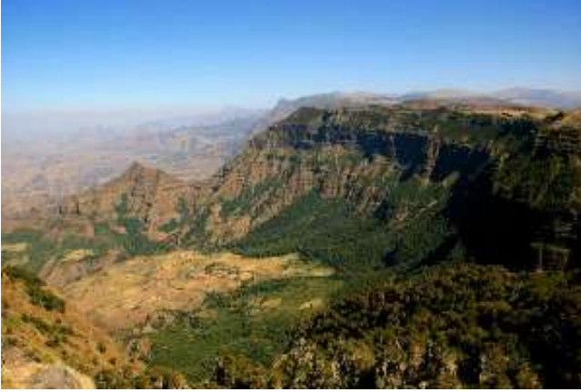
The viewpoints when we trek before we arrive Sankaber, along the escarpment