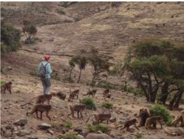
Group of Gelada Baboon up-close

We will meet you in the morning at Gondar Airport or your hotel in Gondar. Drive from Gondar to Debarq, which is the headquarter town for the national park. We will stop here to get a permission to enter to the park and meet the scout. We will have tea and coffee break and visit the local market if we have time. The local market is open every day, and every Wednesday and Saturday is the big market day. From Debarq town, we will drive to the park gate, which is about 16km from the town. We will drive to the first area of the national park, where we start trekking. The starting point will be flexible depend on your interest and time. You will be rewarded with marvelous escarpment and different plant species. You will most certainly encounter troops of the endemic Gelada Baboon and see them up-close. You may also see clipspringer, bushbuck, different plant species and birds species. We will continue trekking to Sankaber camp where we camp the first night.