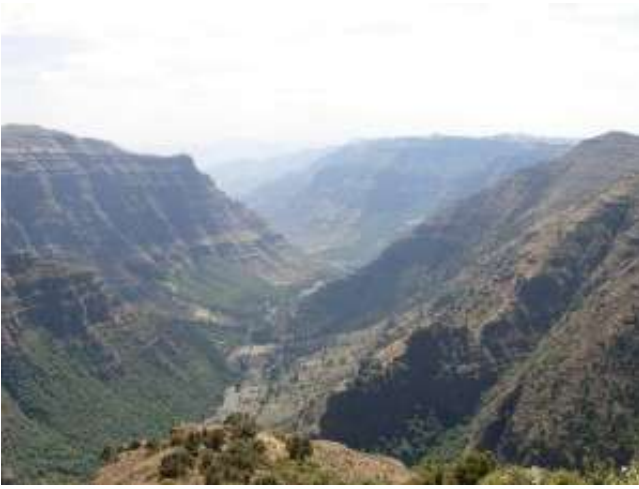
Viewpoints where you relax after trek around Sankaber Camp