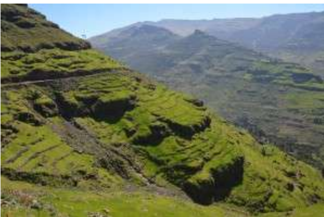
Driving back through such wonderful topography...

After a breakfast, we will drive from Chennek camp to Gondar or Axsum as soon as you get ready to depart.