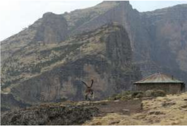
Wildlife and scenery of Chenneck to Mt. Bwahit

📍 Option2: Gondar – Sankaber camp (3,250m) – Gich camp (3,600m) – Mt. Emet Gogo (3,926m) – Mt. Innatye (4,070m) – Chenneck camp (3,620m) – Mt. Bwahit (4,430m) – Chenneck (3,620m) – Gondar or Axsum