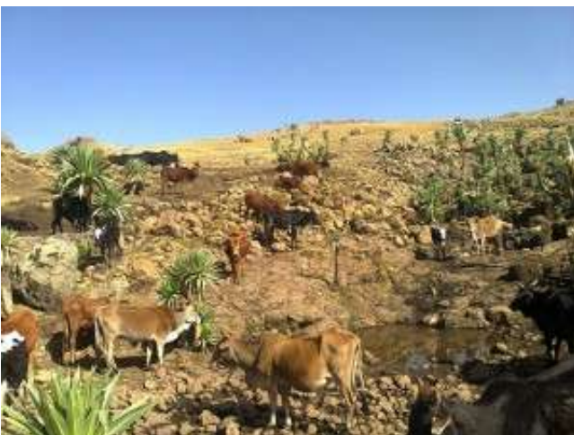
Gich village cattle in the morning

In Gich campsite, the sunrise is earlier than the other campsites. After breakfast, we will climb to Mt. Imet Gogo, an incredible rocky promontory and the most spectacular view point in the Simien Mountains. This is really breathtaking view and you will never forget in your mind. 300m gentle slope take you to the summit that grants 360 degree views over the Simien Mountain range. It descends about 300m to the valley, which is the source of the Jinba river. The trekking route passes vegetated area through Festuca grassland, Lobelia plant, everlasting flower, Erica Arboria tree. Then, we will climb Mt. Innatye about 500m up to the summit passing through the jangle. You will enjoy the stunning views and terrifying vertical drop views. The views are arguably the best in the Simien Mountains. After having a picnic lunch on the top of the Mt. Innatye, the path follows mostly downhill though open grassland and Giant Lobelia towards Chenneck camp. Chenneck camp is the third camping site of the national park and is located in a beautiful valley at the foot of the Mt. Bwahit, at the altitude about 3,620m. You will encounter a number of stunning viewpoints along the way. Moreover, this area is superb for wildlife with both Gelada Boboons and Walia Ibex.