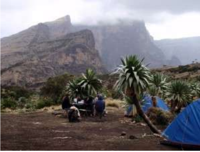
Chenneck campsite, one of the best camping area