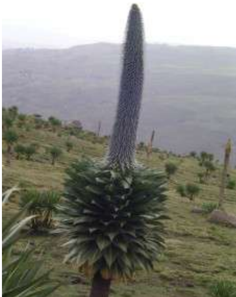
Giant Lobelia, evergreen plat in the Afro Alpine Moorland