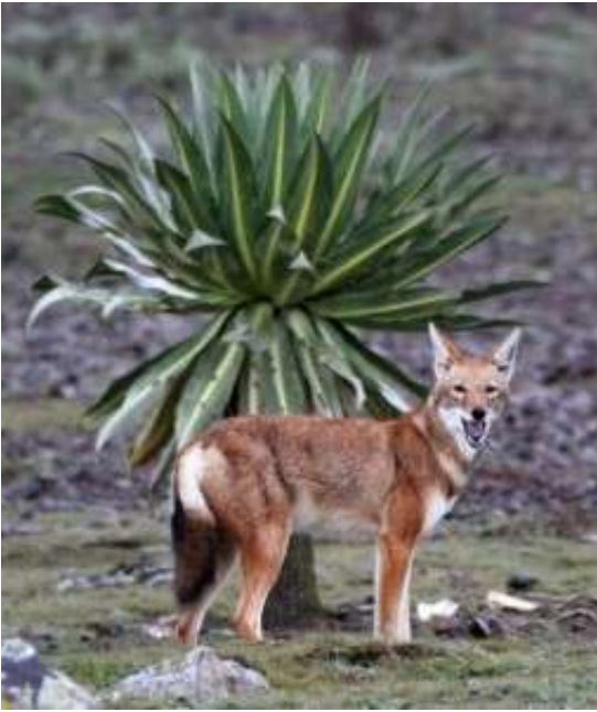
Ethiopian Wolf around the source of Jinba river