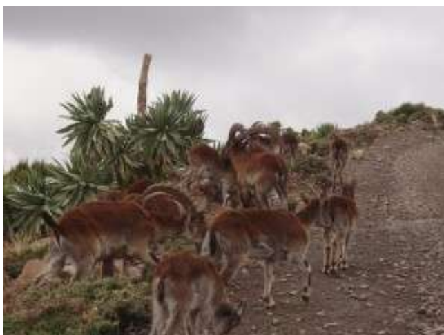
Chenneck campsite to Mt. Bwahit, the best spot for seeing Walia Ibex