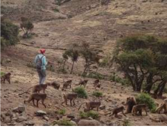
Group of Gelada Baboon up-close