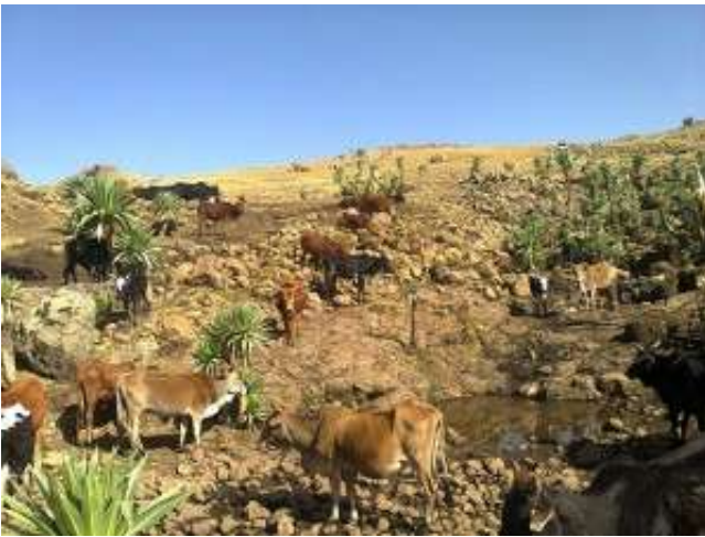
Gich village cattle in the morning

In Gich campsite, the sunrise is earlier than the other campsites. After breakfast, we will climb to Mt. Imet Gogo, an incredible rocky promontory and the most spectacular view point in the Simien Mountains. This is really breathtaking view and you will never forget in your mind. 300m gentle slope take you to the summit that grants 360 degree views over the Simien Mountain range. It descends about 300m to the valley, which is the source of the Jinba river. The trekking route passes vegetated area through Festuca grassland, Lobelia plant, everlasting flower, Erica Arboria tree. Then, we will climb Mt. Innatye about 500m up to the summit passing through the jangle. You will enjoy the stunning views and terrifying vertical drop views. The views are arguably the best in the Simien Mountains. After having a picnic lunch on the top of the Mt. Innatye, the path follows mostly downhill though open grassland and Giant Lobelia towards Chenneck camp. Chenneck camp is the third camping site of the national park and is located in a beautiful valley at the foot of the Mt. Bwahit, at the altitude about 3,620m. You will encounter a number of stunning viewpoints along the way. Moreover, this area is superb for wildlife with both Gelada Boboons and Walia Ibex.