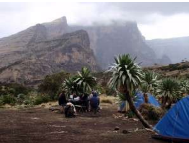
Chenneck campsite, one of the best camping area