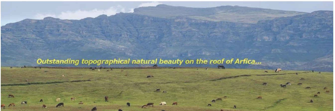
Outstanding topographical natural beauty on the roof of Arfica...