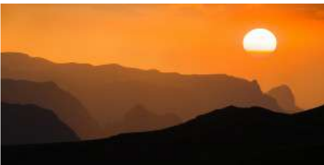
Gich camp sunset on the top of Kedadit

From the Jinba waterfalls, we will continue to Jinba river and have a picnic near more peaceful waterfall. Then we will head to Gich village. Just before you reach Gich campsite, there is wonderful opportunity to visit one of the traditional village houses for traditional coffee and to experience the local living style (depends on your interest). After we arrive at the campsite, you have some time for snack and then head out for a short optional sunset trek up about 185m above the camp to Kedadit. On this point (3,786m), you will look 360 degree around the Simien Mountains and to the lowland mountains. Then, we will come back to the camp for dinner.