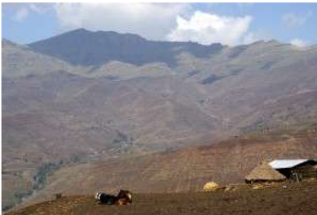
From Ambiko to Mt. Bwahit Peak.