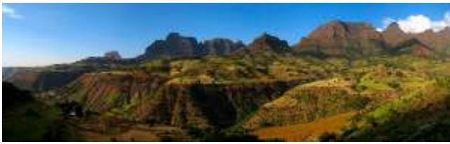
Looking upward from Mekarebya camp to highland mountains

After a breakfast, we will set off the first lowland trekking in the Simiens. This is highly recommended area for bird watchers. We will start at about 9 a.m. in the morning and wonder about the campsite which is warm and beautiful. Then we will trek down to Lamo along the downhill (called Akakiwen). After about 2 hours, the trail leads us to the river. You could relax swimming, sitting under a big fig tree and ficus tree, or reading a book. In the afternoon, we will trek to Mekerabya camp nearby local school and small village at the altitude of 2,100m.