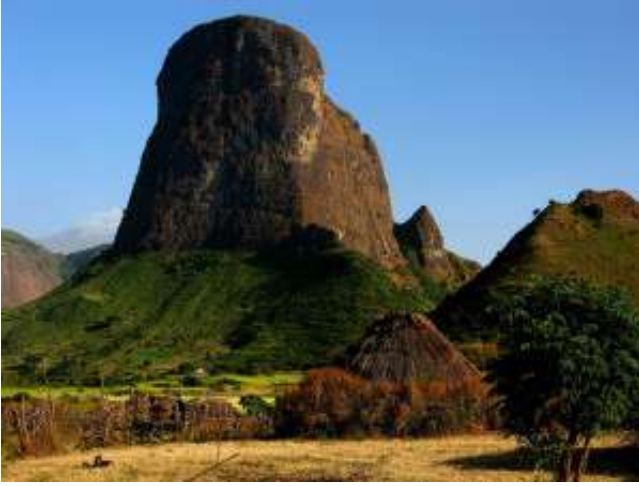
Mulit Camping Site, the last camping site under stunning hill