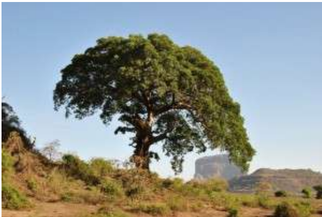
Relax under the big fig tree...