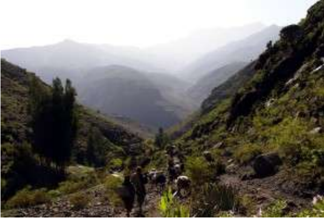
Chiroleba village-the way to go from Chenneck to Ambiko through the valley via Mashera River