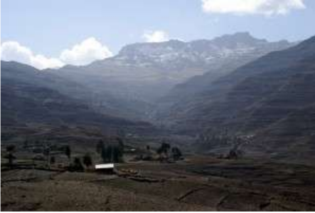
From Ambiko to Ras Dejen