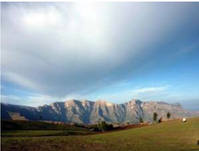
Sona-looking upward to Mt. Innatye

On this day we will walk back to Mesha river. From Ambiko camp to Sona camp is about 26km, 10 hours trekking. From Mesha river, we start ascending to Ategeba village. Then, the route undulates to Arkwasiye village. People in this area engage in barley farming and you will see their farming activities. The harvesting time is from October to January, and ploughing and sowing time is from April to June. We will descend down from Arkwasiye to Sona campsite, which is located at the altitude of 3,100m. We will spend the sixth night at Sona campsite.