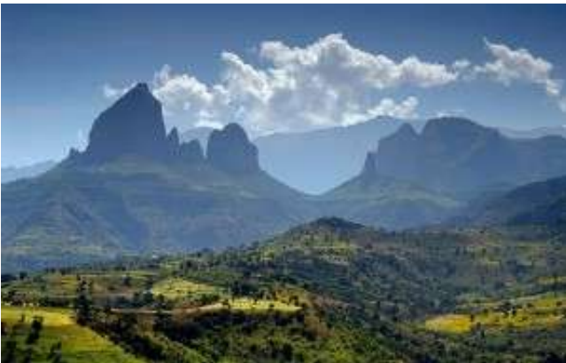
lowland mountains of the Simien

After a breakfast, we will trek for 3 to 4 hours to Adi Arkay, which is the small town out of the park where the trekking route ends. When you drive from Gondar to Axsum, you will pass through this town. When we arrive at the town, we will have a break and enjoy tea and coffee and drive to Gondar or Axsum.