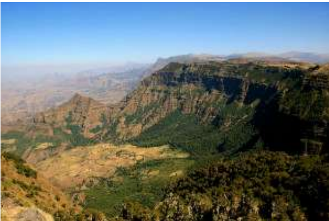
The viewpoints when we trek before we arrive Sankaber, along the escarpment

We will meet you in the morning at Gondar Airport or your hotel in Gondar. Drive from Gondar to Debark, which is the headquarter town for the national park. We will stop here to get a permission to enter to the park and meet the scout. We will have tea and coffee break and visit the local market if we have time. The local market is open every day, and every Wednesday and Saturday is the big market day. From Debark town, we will drive to the park gate, which is about 16km from the town. We will drive to the first area of the national park, where we start trekking. The starting point will be flexible depend on your interest and time. You will be rewarded with marvelous escarpment and different plant species. You will most certainly encounter troops of the endemic Gelada Baboon and see them up-close. You may also see clipspringer, bushbuck, different plant species and birds species. We will continue trekking to Sankaber camp where we camp the first night.