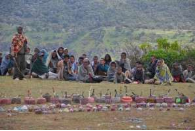
Local children selling handicraft products along the trekking route