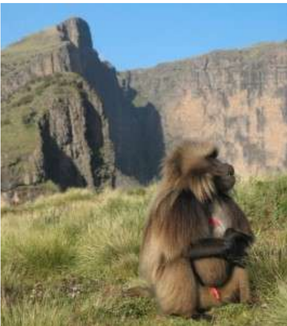
Gelada Baboon around Chenneck Camp

After breakfast, we will make a round trek from Chenneck camp. The path follows through the escarpment and enjoys the view of Mt. Emet Gogo (3,926m). As long as time allows, we will climb up around the altitude of 4,000m or climb Mt. Bwahit (4,430m). You will see Walia Ibex, many different birds such as vultures and small birds, and different plant species such as evergreen and the high elevation plant Lobelia which grow above 3,600masl, everlasting flower, Erica Arboria tree, St. Johns Worttree( Hypericumrevoltum ), and Festuca grass. In the afternoon, you will drive to Gondar or Axsum.