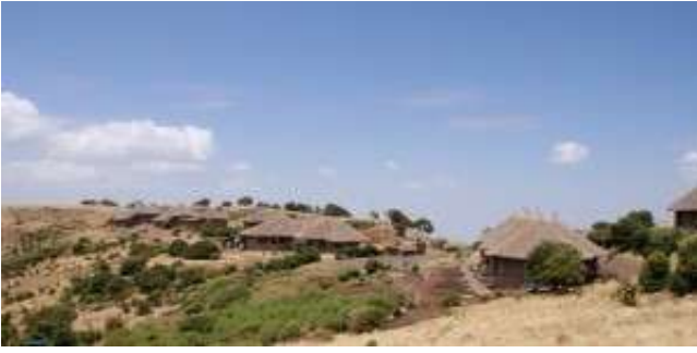
Simien Lodge, luxury accommodation in the Simien Mountains

heading about 6km to Buit Ras, the first area of the national park. Simien Lodge where you stay is only luxury hotel in the Simiens and located in Buit Ras. After check-in, we will make an easy trek around the lodge. You could enjoy the beautiful escarpments and encounter groups of baboons up-close.