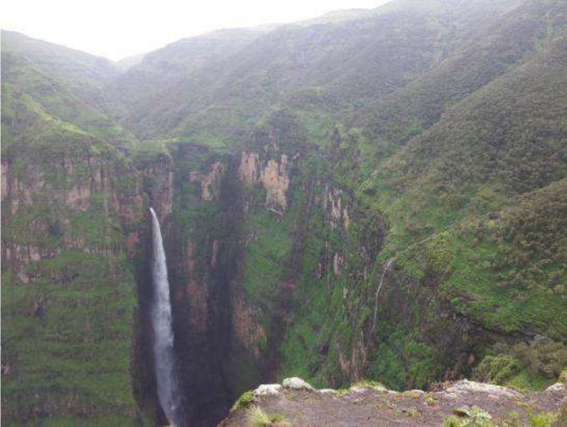
Jinba waterfall, the longest fall in Ethiopia

Vulture, Hooded Vulture, Whitebacked Vulture, Lapped- faced vulture and Lammergayer along the cliff. Lammergayer is one of the biggest bird prey in the world and feeds bone marrow. This area is best place for lammergayer to break the bone. This area is also good to see different small birds such as one of the Ethiopian endemic bird- Abyssinian Catbird, Starlings, Sweafts and Swallows. After the sightseeing, we get back to the main road (the place called Kavamesk) where the car stops to drive us to Gondar or Axsum.