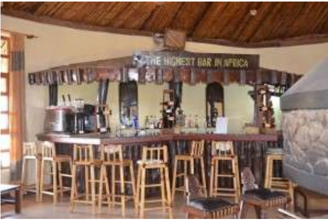
Simien Lodge, bar