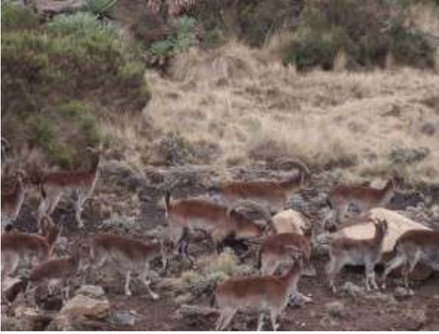
Chenneck camp, one of the best camping area in the Simien Mountains to spot Walia Ibex